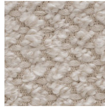
01 MALIBU SAND