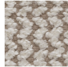
02 HARVEST GRAIN