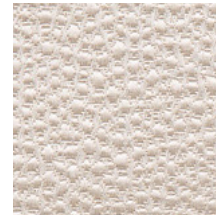
07 ROSE QUARTZ