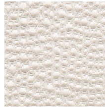
06 PEARL WHITE