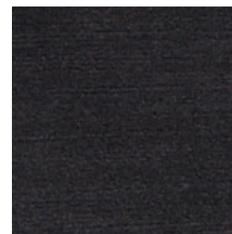
11 PITCH BLUE