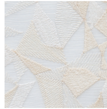
01 SOFT LIGHT