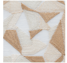
03 NATURAL STATE