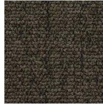
04 PEAT HEATHER