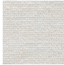
01 WINTER WHITE