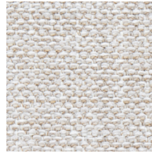
01 SAND DOLLAR