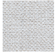
03 WARM & COOL