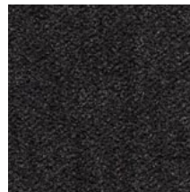
02 BLACK PEARL