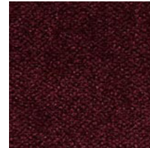
04 VELVET ROPE