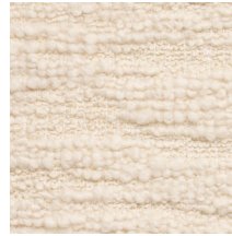
01 SOFT LIGHT