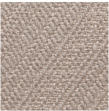
06 DOVE GREY