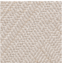
03 LIGHT ASH