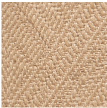
05 DESERT CAMEL