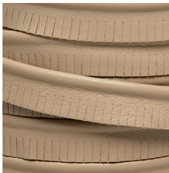
ON THE EDGE 001