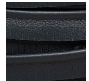
26 NEW BLUE