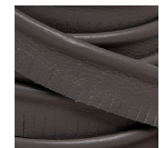
23 ABYSS HEATHER