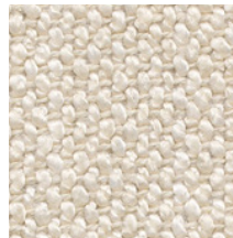
01 EGGSHELL CREAM