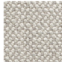
02 FOGGY MORNING