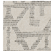
05 EBONY AND IVORY