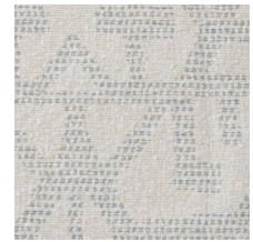
03 ICE WATER