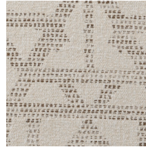
04 WHITE CHOCOLATE