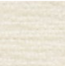
01 SOFT LIGHT