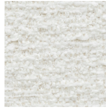
01 WHITE CAP