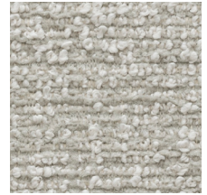
03 SPRING SNOW