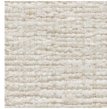
01 WINTER WHITE

Knit backing is recommended for use on HOLLY HUNT upholstered product. For all other upholstery, please consult your workroom.