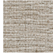
02 HALF BLEACHED