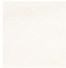
03 PINA COLADA