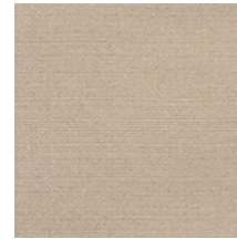
05 BAILEY'S CREAM