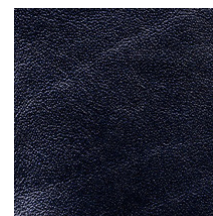
11 BLUE STEEL