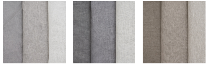
02 GREY MIST