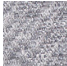
04 SNOW MELT