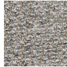
03 ICE AGE