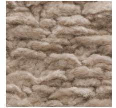
03 HARVEST GRAIN