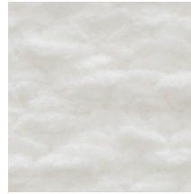
01 WHITE CAP