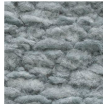
07 BAY BLUE