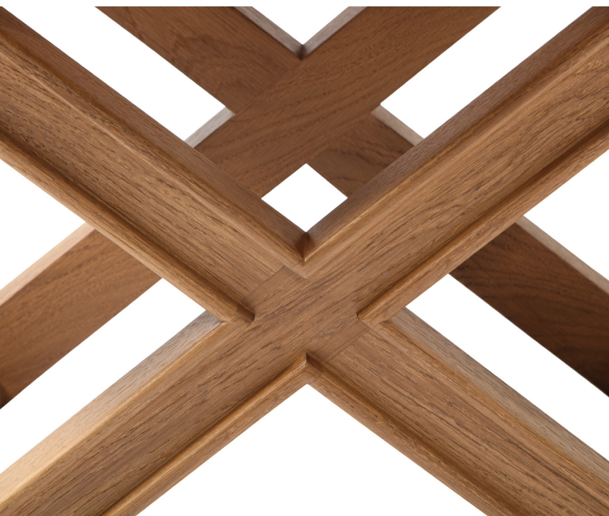
SHOWN BELOW IN HOLLY HUNT LEATHER 7200/03 PRECIOUS METAL; ROSE GOLD WITH OAK NATURAL FINISH