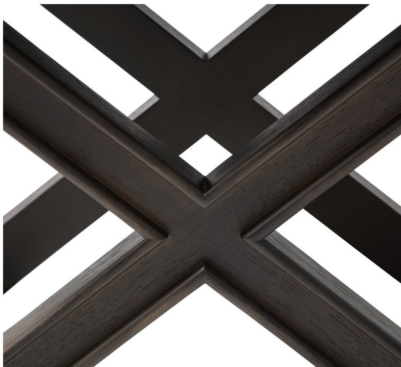
SHOWN ABOVE IN HOLLY HUNT LEATHER 6000/47 STINGRAY; BLACK PEARL WITH OAK GREY FINISH