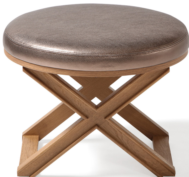
SHOWN ON REVERSE IN HOLLY HUNT LEATHER 6000/70 STINGRAY; MARINA WITH OAK BROWN FINISH (ROUND) AND HOLLY HUNT LEATHER 7200/03 PRECIOUS METAL; ROSE GOLD WITH OAK NATURAL FINISH (RECTANGULAR)