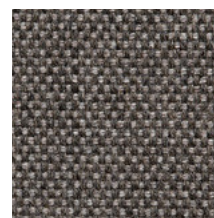
03 MOUNTAIN SIDE