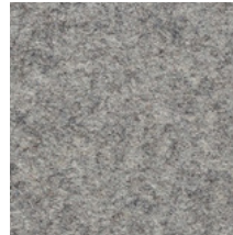
05 SILVER FOX