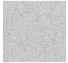
02 SILVER LAKE