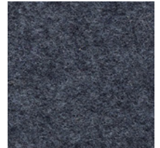
08 WATER'S EDGE