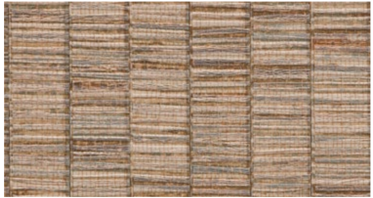
W9010/04 BRONZE AGE