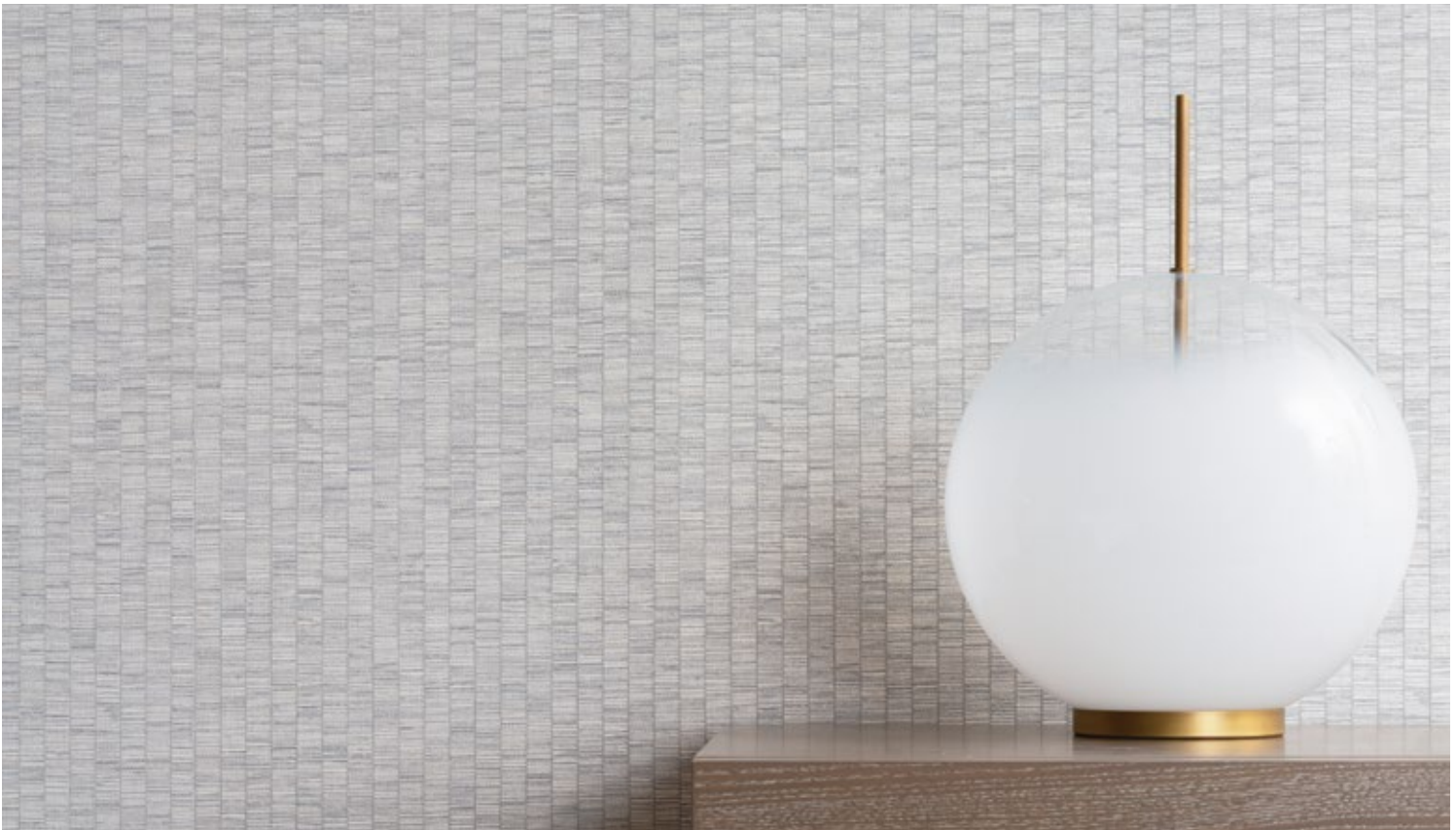
FEATURED W9010/01 MIST, ELEMENTAL CABINET AND VENICE M MISTY TABLE LAMP