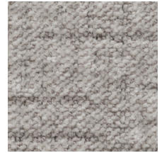
03 WARM GREY