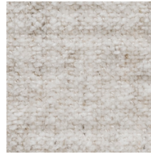
01 SOFT LIGHT

Knit backing is recommended for use on HOLLY HUNT upholstered product. For all other upholstery, please consult your workroom.