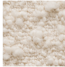
01 WINTER WHITE

Knit backing is recommended for use on HOLLY HUNT upholstered product. For all other upholstery, please consult your workroom.