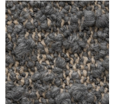
06 GOLDEN GREY