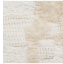
01 WINTER WHITE

Knit backing is recommended for use on HOLLY HUNT upholstered product. For all other upholstery, please consult your workroom.