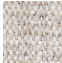
04 SAND DOLLAR