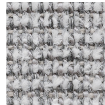
05 ROCK SALT