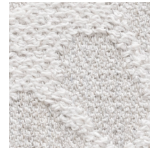
02 OCEAN FOAM