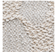
03 SILVER STONE