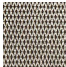
02 PLATINUM (PRINTED ON 6002/15)