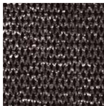
01 GUNMETAL (PRINTED ON 6002/15)