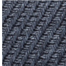
04 NEW BLUE