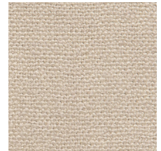
03 NATURAL STATE