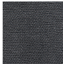
08 NIGHT SKY