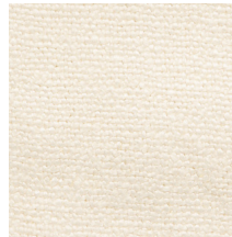
01 SOFT LIGHT