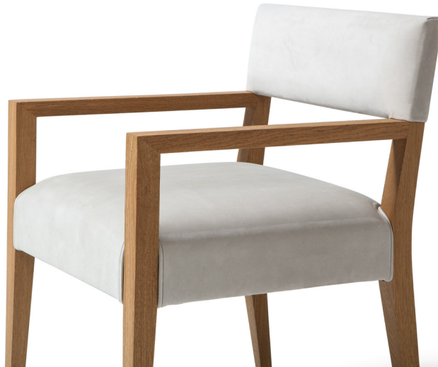
SHOWN IN HOLLY HUNT LEATHER 9379/03 NORDIC; ICED WITH OAK BROWN (ABOVE) AND OAK GREY (BELOW) FINISHES