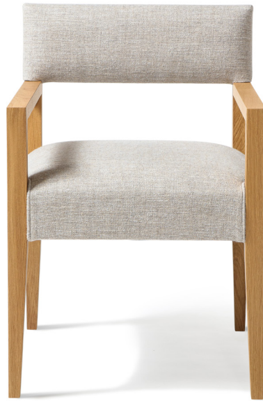
SHOWN ABOVE IN GREAT PLAINS FABRIC 4017/05 GOLDEN HOUR; WARM GREY WITH OAK NATURAL FINISH