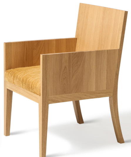
LEFT: 9379/03 NORDIC; ICED