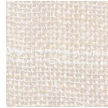
02 HALF BLEACHED