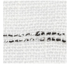
03 BLACK & WHITE