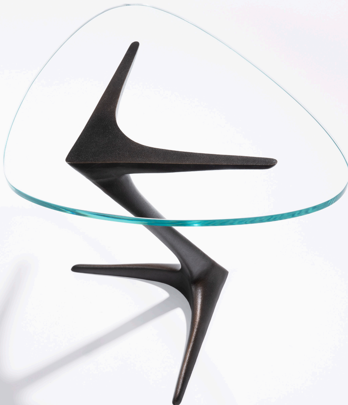
Cast Unicorn End Table Model - 578C | Designed 1959