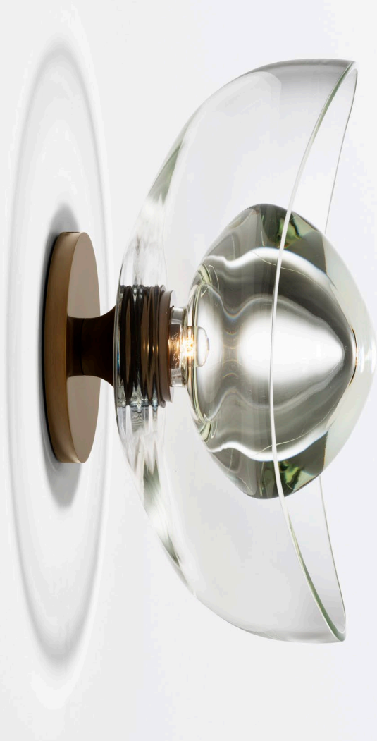
BECKON CEILING MOUNT OR SCENCE