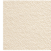
05 WINTER WHITE