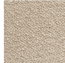
06 HALF BLEACHED