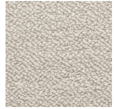
02 TRUE GREY