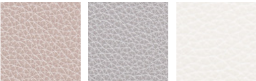
22 VALLEY FOG