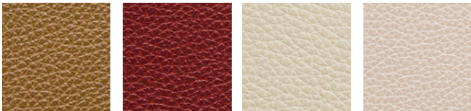
17 TORTOISE SHELL