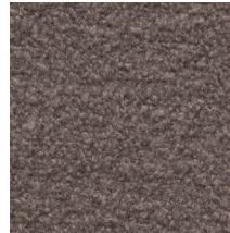
04 SILVER BROWN