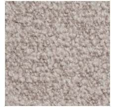
03 SILVER FOG