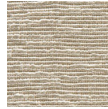
02 WHITE GOLD