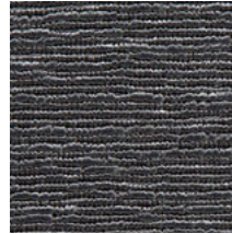
05 REFLECTING POOL