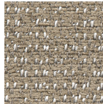
04 GOLDEN GREY