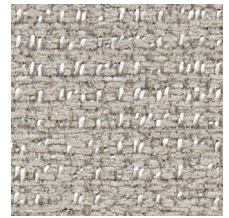
03 WARM SILVER