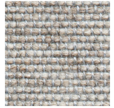
03 SNOW MELT