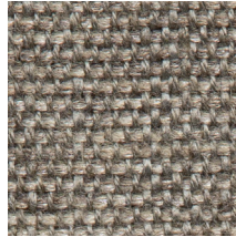
04 ROCKY SHORES