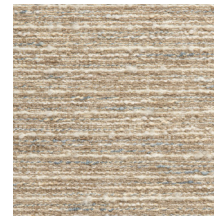
02 WARM & COOL