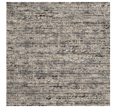
03 SILVER HEATHER