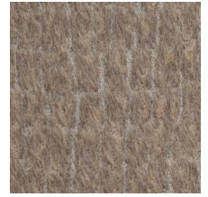
03 PEAT HEATHER