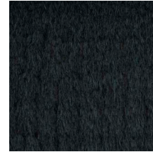
05 DEEP LODEN