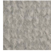
02 SILVER FOX