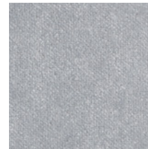
02 TRUE GREY