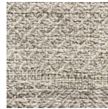
02 WINTER HAZE