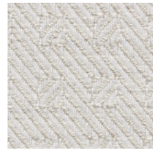
03 FRESH START