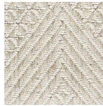
01 GOLDEN LIGHT