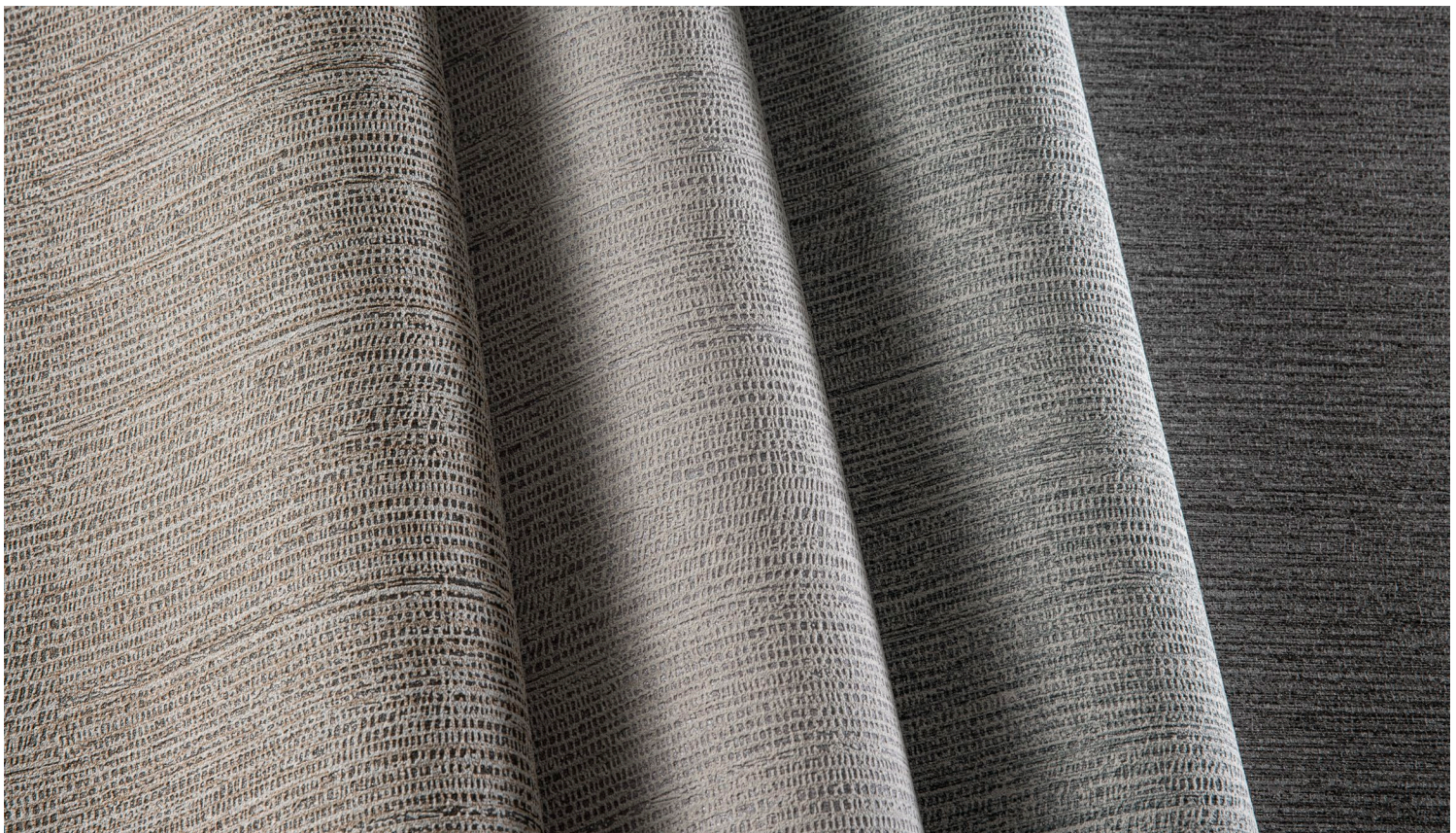
W6026/007 FOG, W6026/006 CEMENT, W6026/008 SAGE, W6026/009 SMOKE